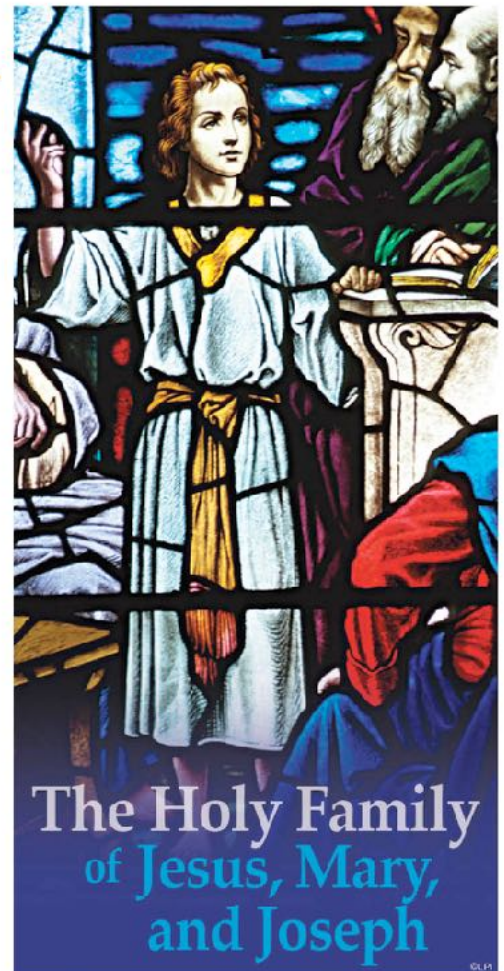
The Holy Family of Jesus, Mary, and Joseph

While families come in all shapes and sizes and no two are the same, they all need a common focus and grounding. Families are intended to be pivotal in providing us with a proper social structure and understanding, a support system, lessons about relationships and communication and the unconditional acceptance and love we so desperately crave. In addition to all of these things, the axis of every family has to be centered on faith. It is here that we can learn about the virtues and discover the windows to God Himself in His gifts of faith, hope, and love. We can learn, modeling our experience after the Holy Family, how to use these as anchors in our lives so that we can live out the other virtues with greater integrity. Because our human families struggle with weakness and sin, we have to come back to the Holy Family often for inspiration and guidance. In the bond of love that they shared, they clung to the anchor of God Himself and endured challenges far greater than many we will ever face.