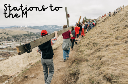
Stations to the M

Thank you, to all our volunteers who helped make Holy Week so epic!