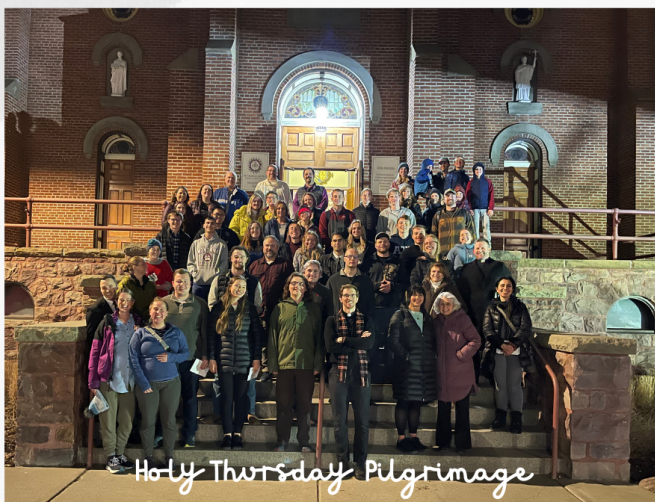
Holy Thursday Pilgrimage