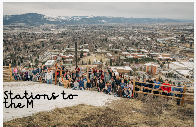
Stations to the M