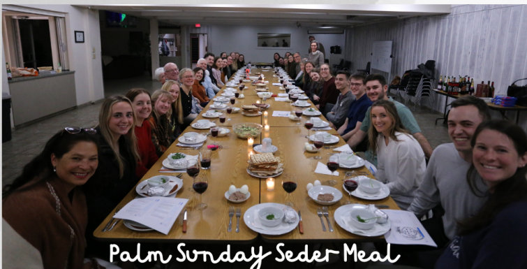
Palm Sunday Seder Meal