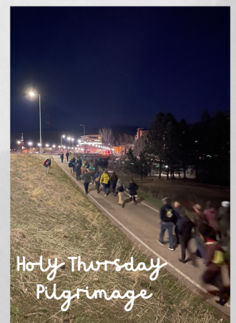
Holy Thursday Pilgrimage