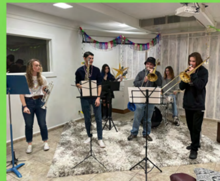
The Wonderful Jazz Band

A Giant Thank You to our Mardi Gras Crew!