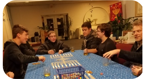
At Har Shalom learning from our new friends how to play dreidel