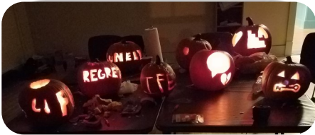
Bottom photo: Students' pumpkins Top photo: Students carving pumpkins

All of our gatherings involve doing , and learning , and sharing . The pumpkin carving night is a good example. The youth were asked to visually represent on their pumpkin something that hurt them. Carvings varied from images of broken hearts to words like "regrets" or "loneliness." Then we talked about the thing that makes jack-o-lanterns beautiful: the light that shines through them! Students were