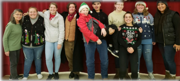
Photos of groups during the breakout box activity and our Christmas card shoot!