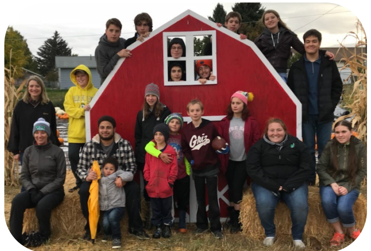
Students at the Missoula corn maze, along with youth from Blessed Trinity!

We also had opportunities to serve. We put on a pancake breakfast as a fundraiser for our program that was very successful! The youth were very helpful in both preparing and serving the food and were a delightful presence to all who attended. Each year we do a YES (Youth Engaging Service Day) and we help to rake and clean the yards of people in our parish communities who may need it. This year was a great success. We had fun helping rake the yards of 6 people in our different parish communities.