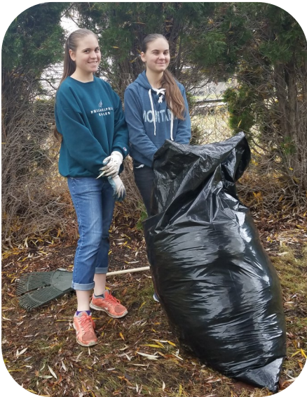
Raking during our annual YES to service day!

We saw many new faces toward the end of November for our breakout box night. Students were split into groups and were asked to break into a box. In order to do so they had to work together to solve puzzles and crack the code! All groups were successful, and we had a great discussion about how to get into the kingdom of heaven. Students were very insightful during the discussion about the puzzles and codes we need to work through together in order to get into that box.